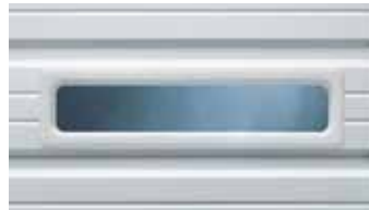
24" X 6" DSB or PLEXIGLAS®

*Note: Both options available with either a black or white frame.