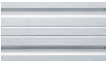
RIBBED PANEL (2000/2400 SHOWN)