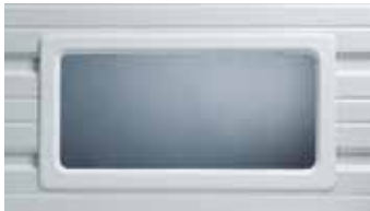
*24" X 12" SINGLE PLEXIGLAS® *24" X 12" INSULATED PLEXIGLAS®