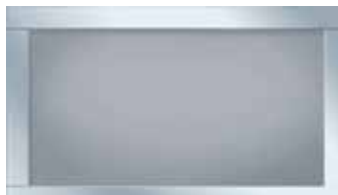
OPTIONAL FULL-VIEW PANEL

Models 2000 and 2400 feature smooth ribbed faces, while Model 2500 has a woodgrain embossed face with ribs. Model 2400 available in brown with woodgrain embossment.