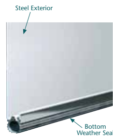
Available in 2000/2400/2500